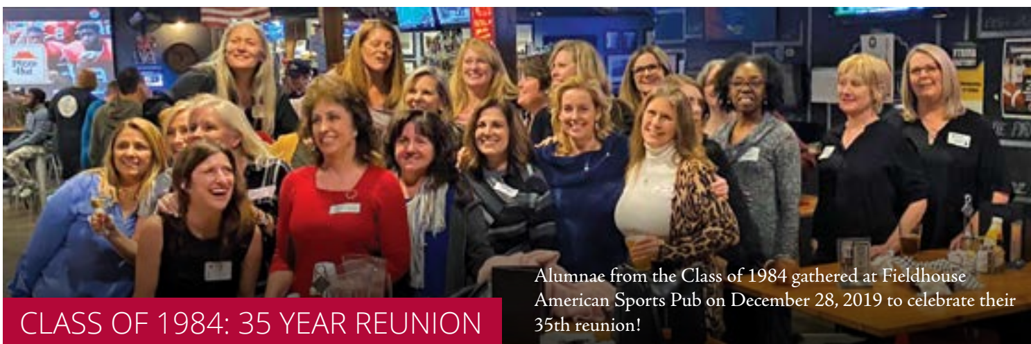
Alumnae from the Class of 1984 gathered at Fieldhouse American Sports Pub on December 28, 2019 to celebrate their 35th reunion!