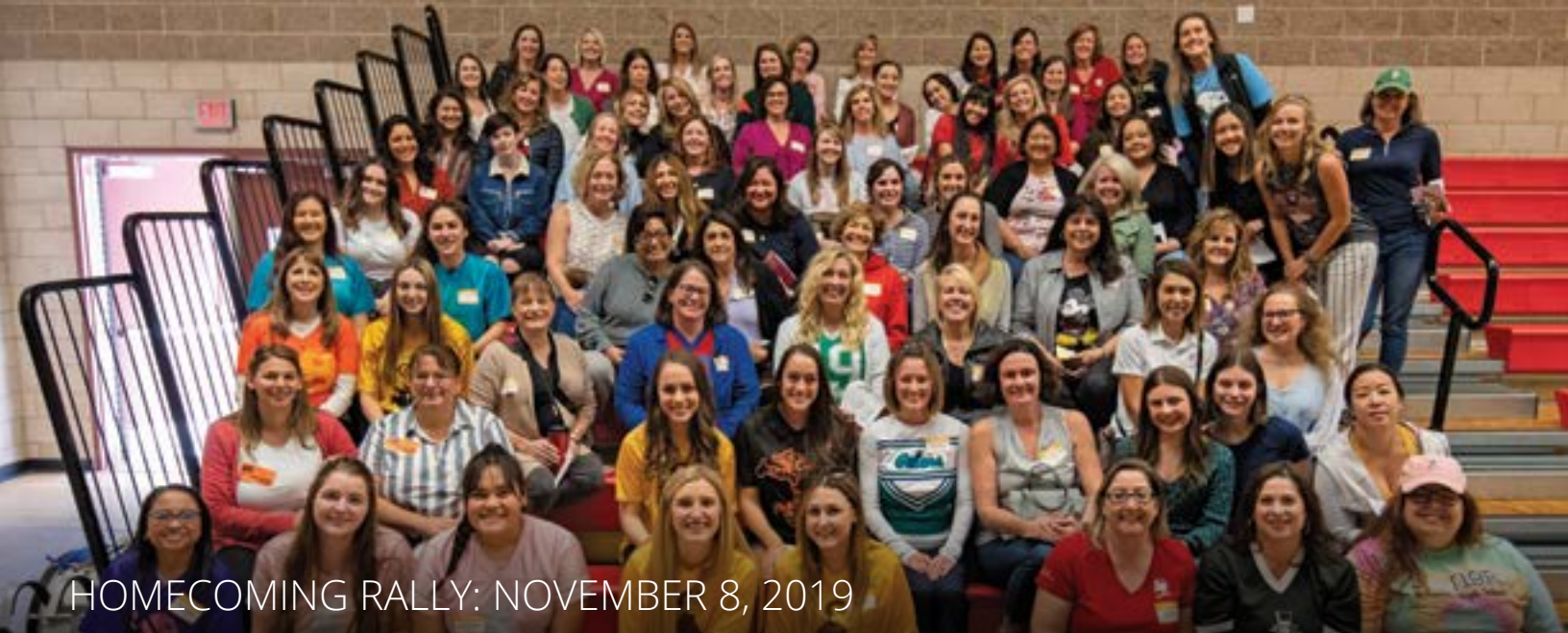
HOMEcoming RALLY: NOVEMBER 8, 2019