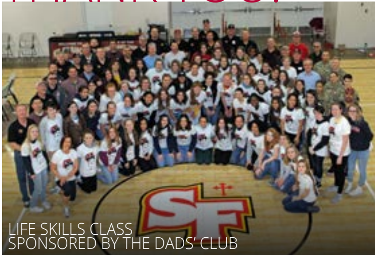
LIFE SKILLS CLASS SPONSORED BY THE DADS' CLUB