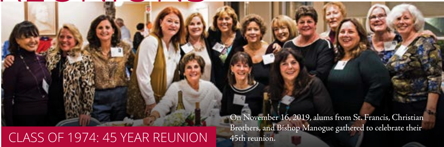
On November 16, 2019, alums from St. Francis, Christian Brothers, and Bishop Manogue gathered to celebrate their 45th reunion.