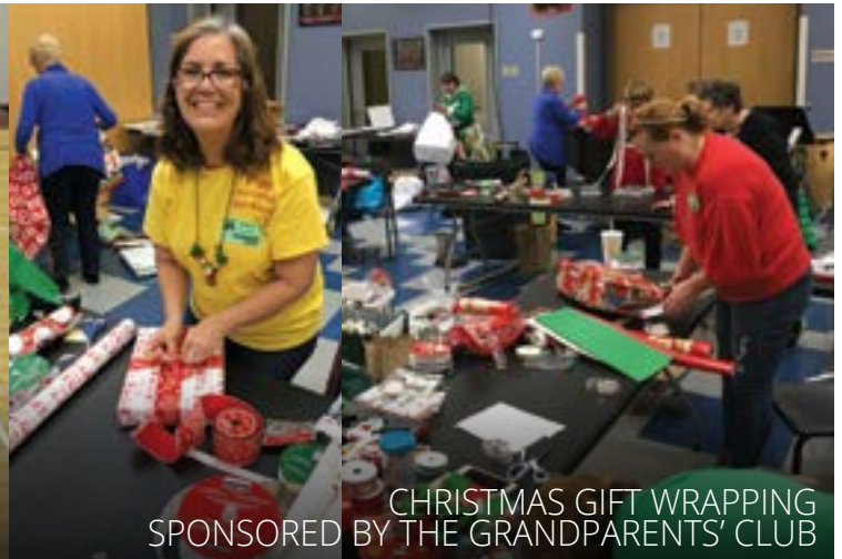
CHRISTMAS GIFT WRAPPING SPONSORED BY THE GRANDPARENTS' CLUB

Thank you to the Dads' Club and Grandparents' Club for sponsoring these exciting new events!