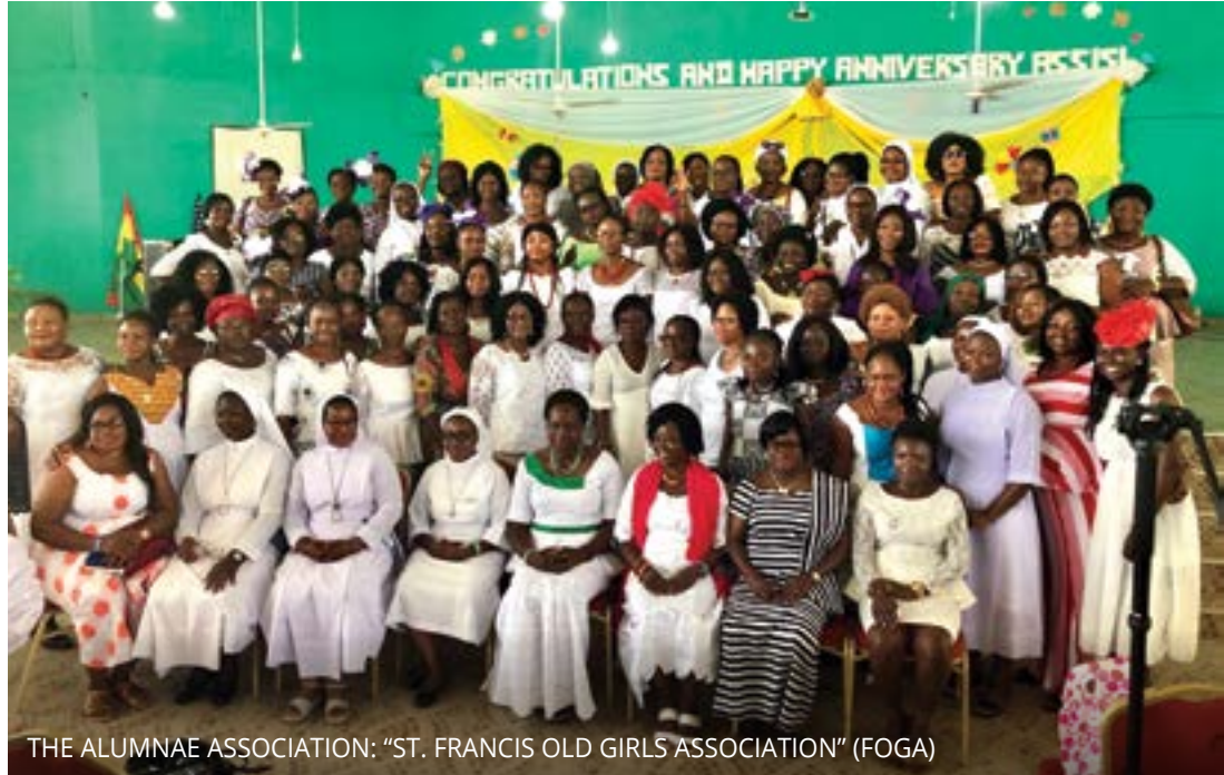
THE ALUMNAE ASSOCIATION: "ST. FRANCIS OLD GIRLS ASSOCIATION" (FOGA)