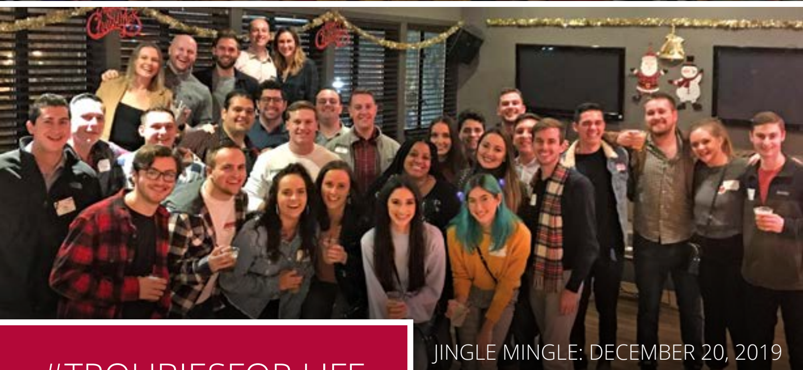
JINGLE MINGLE: DECEMBER 20, 2019