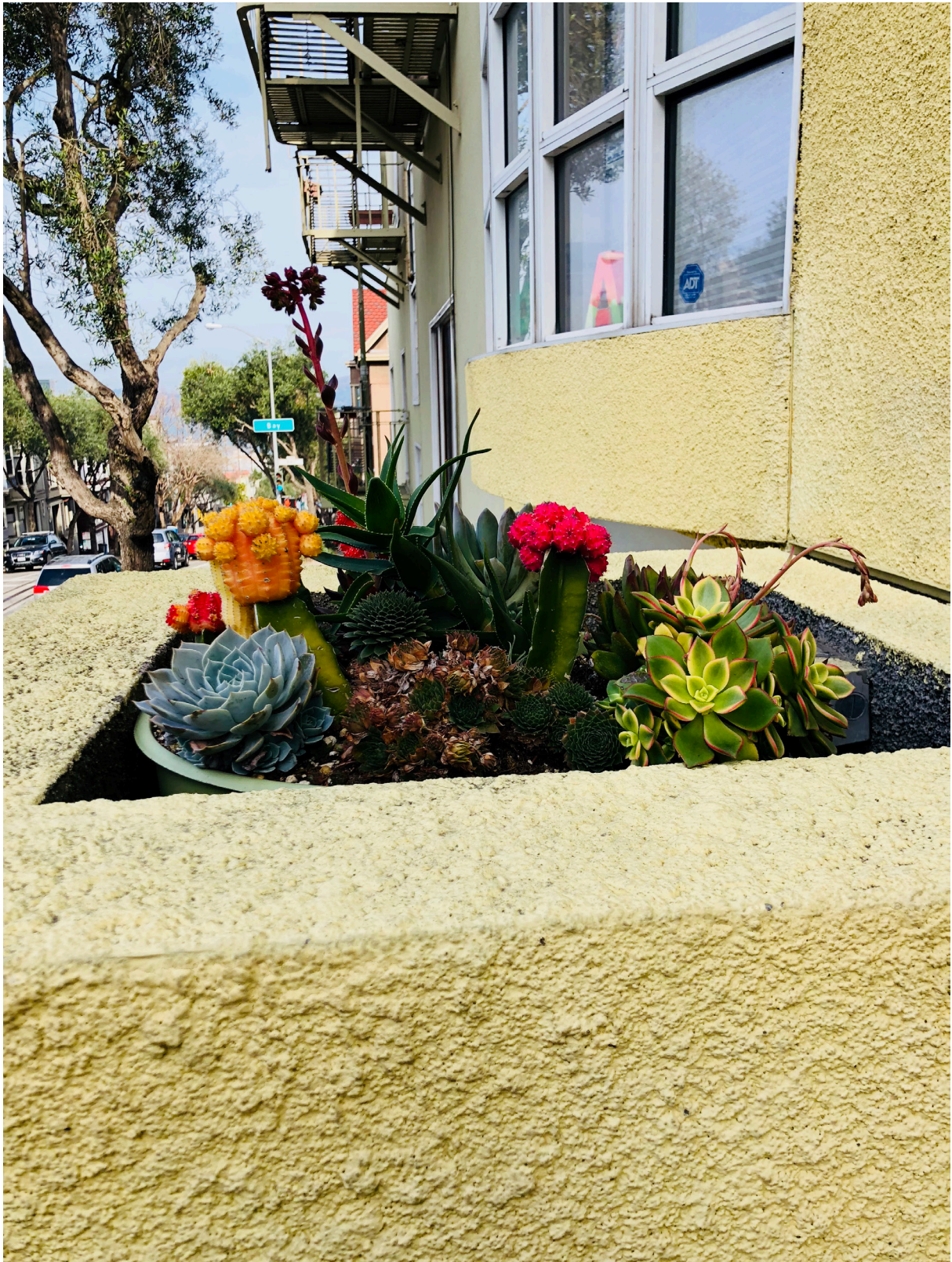
Untitled Janene Tapken