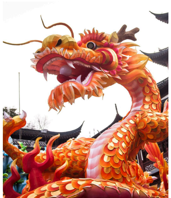
The dragon, an iconic symbol of Lunar New Year, displayed as a statue at a Lunar New Year parade.

Whether it's the vibrant festivities of Diwali, the cultural celebrations of Las Posadas, the joy of Christmas parties, or many other beautiful holidays, each tradition brings its unique flavor to this jolly season.