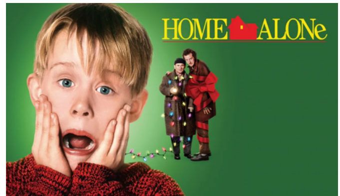
Home Alone movie poster.

and childlike innocence are missing from the film. While there are hints of them throughout the film, they aren't the main focus of it, which is a surprise as it's what is presumed when watching a Christmas movie. This is especially disappointing when those themes are at the core of the first two films. Consequently, Home Alone 3 marked the start of the downhill of Home Alone as a whole, killing all expectations for any future installments (even if they had turned out to be good).