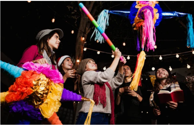
A family enjoying Posada festivities with a pinata (just without the blindfold!).

co-president of La Familia, said. "It is important for us to incorporate these traditions into our community at SF because for us Hispanics these traditions are a part of who we are." Christmas, celebrated December 25th, marks the birth of Jesus Christ. This widely known holiday is celebrated with many people enjoying festive meals, singing Christmas carols, and participating in charitable activities. The figure of Santa Claus, who brings gifts to children, is also a central part of the celebration. Overall, Christmas is a time of joy, reflection, and togetherness, embodying the spirit of love and generosity that Jesus brought to the world.