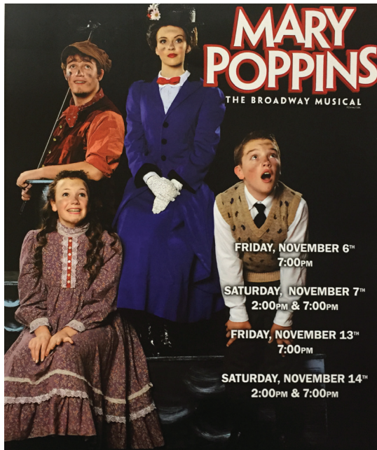
Part of the cast for SFHS's production of Mary Poppins