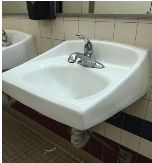
Water left running in the Gym Rest room

Remember to turn off the faucets in the gym bathrooms because they are not automatic like the other bathrooms' sinks.