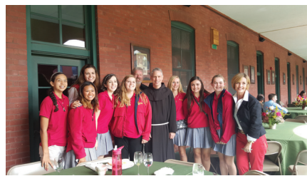
Troubies meet a Franciscan Priest