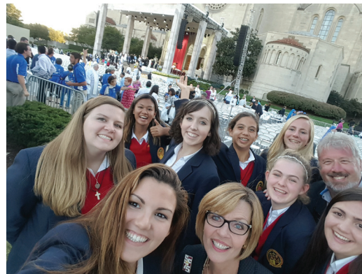
Selfie time before the Canonization Mass

my four day journey and exposure to so many different cultures uncovered the power of religion and its ability to unite people under one cause. My vow is to continue my faith as a strong follower of Christ and to remember to keep moving forward.