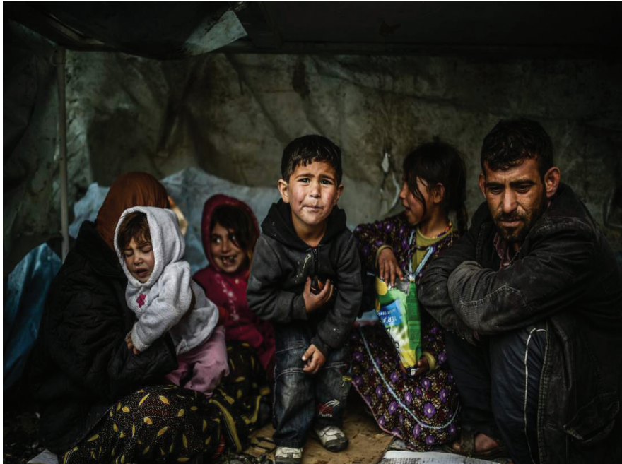
A Syrian refugee family huddles under a tent in a Turkey refugee camp.

In early September, the image of a drowned toddler who had been fleeing the violence in Syria with his family surfaced across social media and the news. The picture brought the ongoing Syrian refugee crisis back into focus across the globe. This crisis, beginning with the Arab Spring in 2011, has grown since the start of the Syrian civil war. For the last four years, it has caused more than four million individuals to seek refuge across the world. Currently, the United Nations has estimated that 400,000 people will flee Syria by the end of this year. While many do not have a set destination, the majority of Syrian refugees have fled to Turkey, Lebanon, and Jordan, Time Magazine's journalist Massimo Calabresi states.