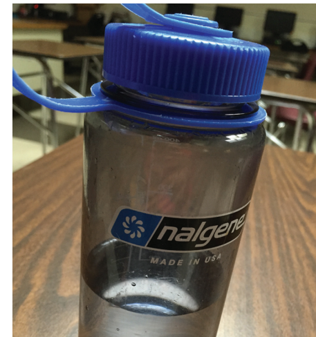
Refillable water bottle

sink about halfway with water, and use that water to clean. That process saves gallons of water.