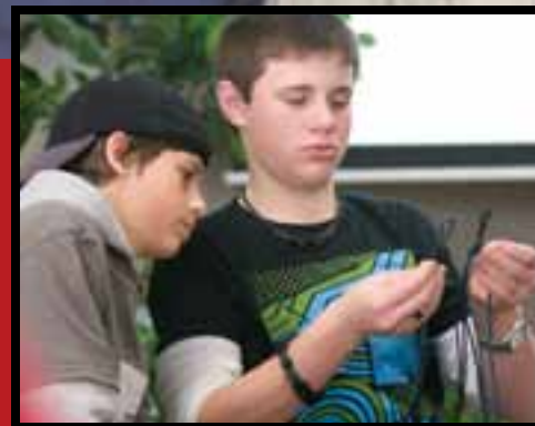
90 FLEECE BLANKETS BEING DELIVERED TO SHRINER'S HOSPITAL; SERVING THOSE WITH DISABILITIES; A TEEN LEADER HELPING A YOUTH WITH A PROJECT FOR SOLDIERS OVERSEAS