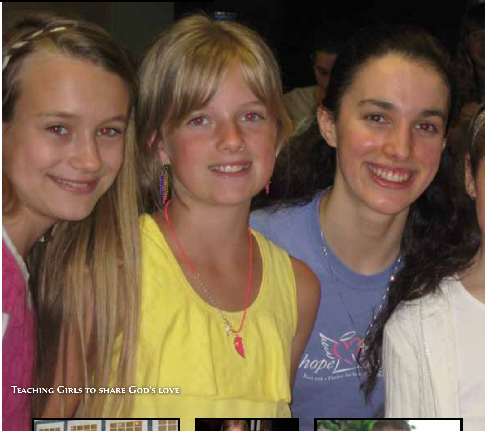
TEACHING GIRLS TO SHARE GOD'S LOVE