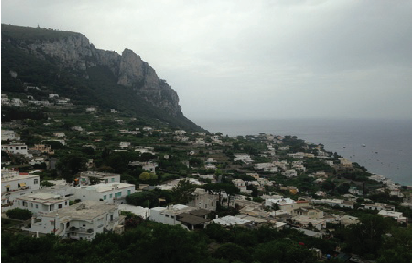
“Untitled” Madeleine Roche