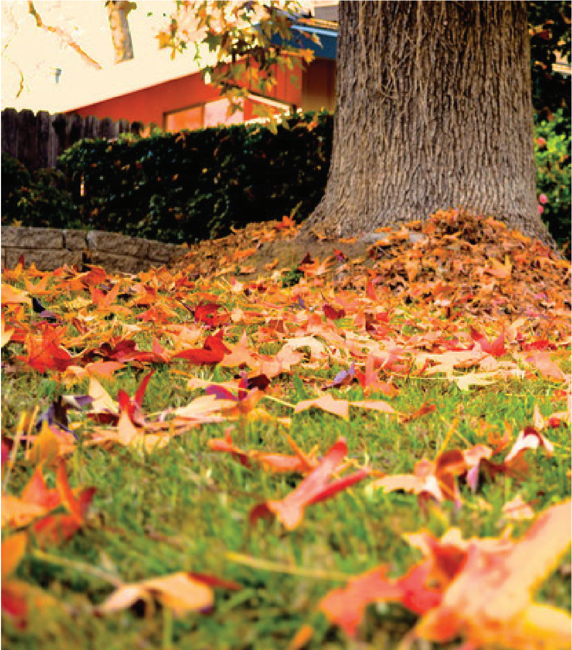
“Sky Falls in Burnt Colors” Brooke Aprea