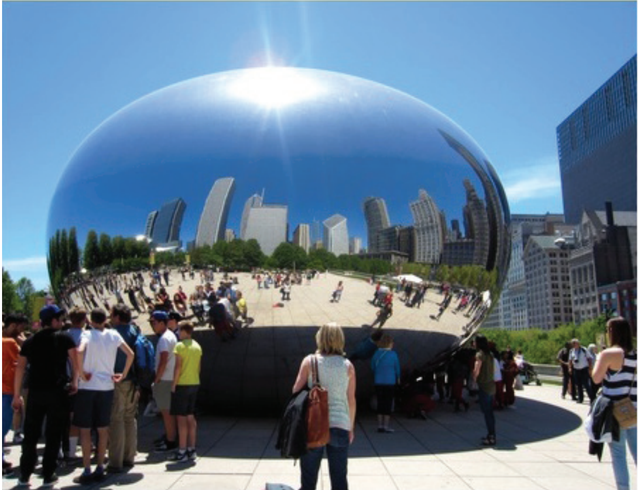
“Millennium Park, Chicago” Sophia Fox